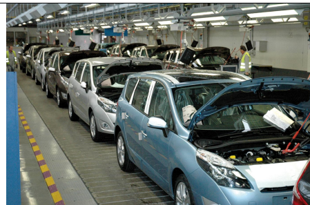
Figure 2: « Scenic » assembly area