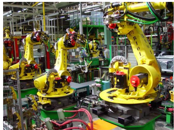
Figure 1 : Sheetmetalworking area

During visit, you will see sheetmetalworking and assembly areas. More details will be given later