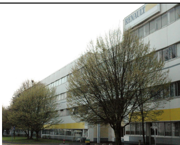
Figure 3: entrance of Factory